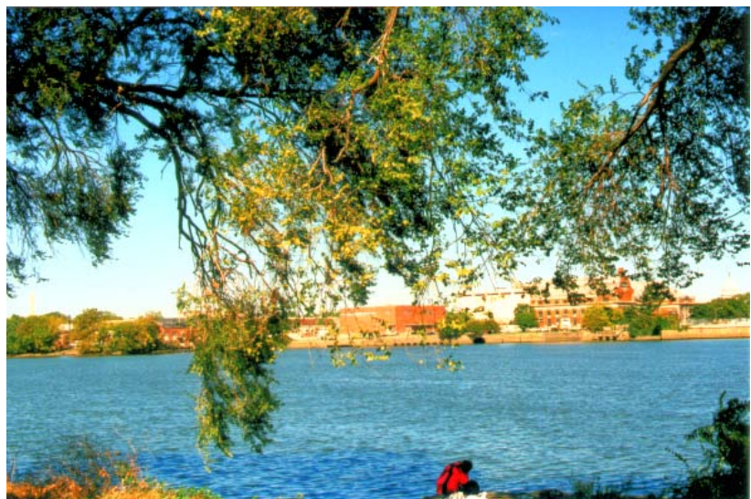
View of the Potomac River's and the U.S. Navy Yard from the Arboretum