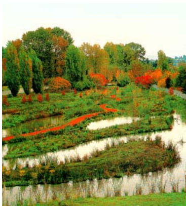
Proposed Wetlands to include a variety of botanical gardens