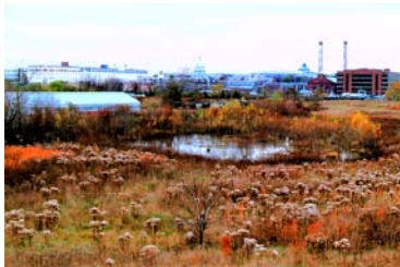
Existing Site to include 11 acres of Wetlands