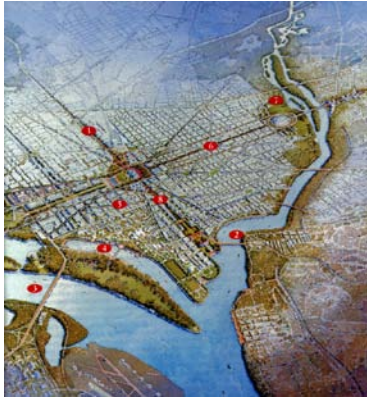
National Capital Planning Commission map of Heritage Site #2 for Frederick Douglass memorial arboretum