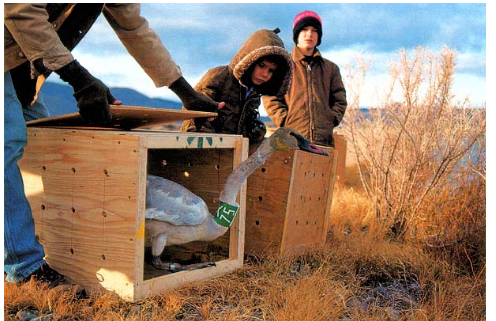
Recommended treat and release programs for migrating birds