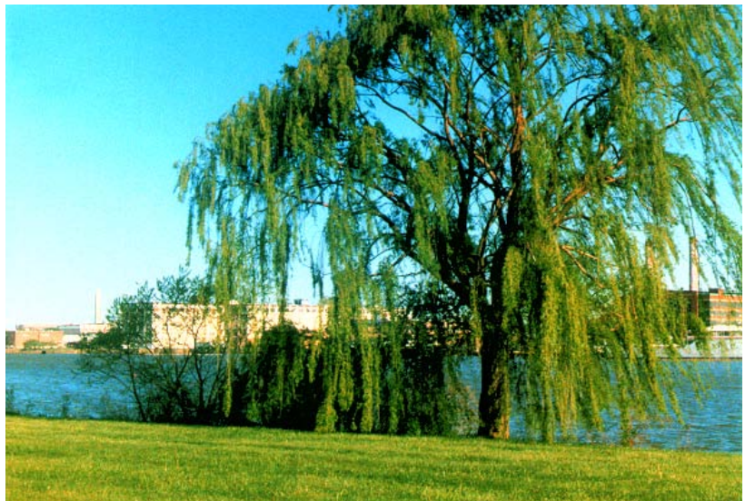
Available open space for riverside recreational activities along the Potomac