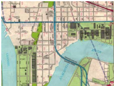
Map of Washington, D.C. showing memorial bridge connection to arboretum