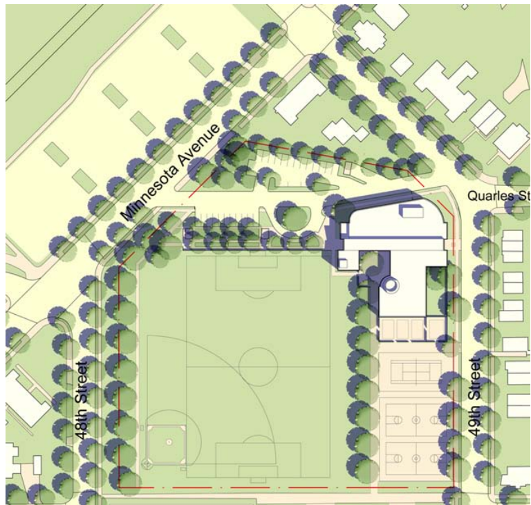
Illustrative Recreational Facility Site Plan

Various Landscape Design components include tennis courts, combination football and baseball field, perimeter landscaping, playground, courtyard, and irrigation system.