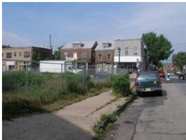
Exist. view looking South down South Clinton Avenue