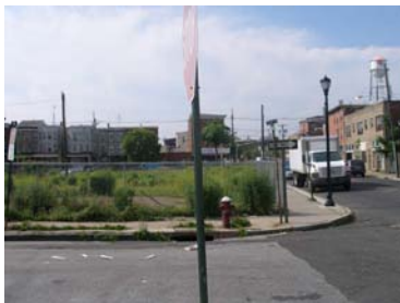
Exist. view looking East down Hamilton Avenue