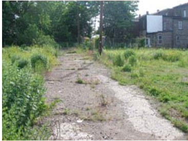
Exist. view of alley/easement thru site's interior