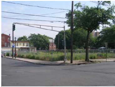
Exist. view of corner at Hamilton and South Clinton Avenues