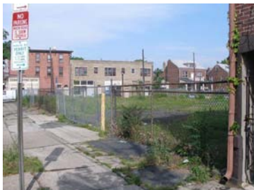
Exist. view looking West down Hamilton Avenue