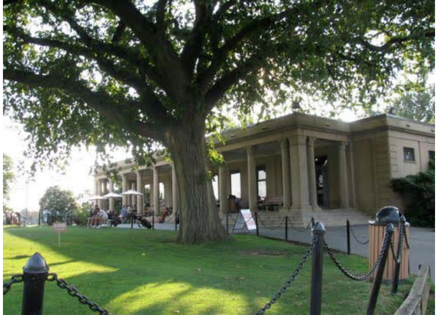
Renovation of Historic East Potomac Golf Course Clubhouse