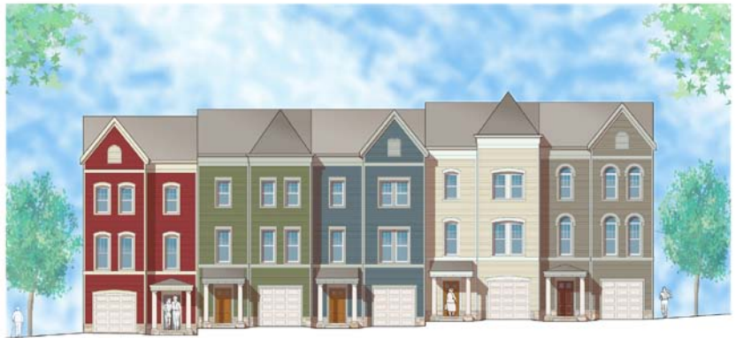
Residential Townhouse Units

This project also involved the creation of a Planned-Unit Development requiring various subsequent urban design reviews, public hearings, coordination, and approvals from multiple District of Columbia Municipal agencies; the Zoning Commission; as well as, the National Capital Planning Commission.