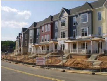
Perimeter Townhouses (Under Construction)