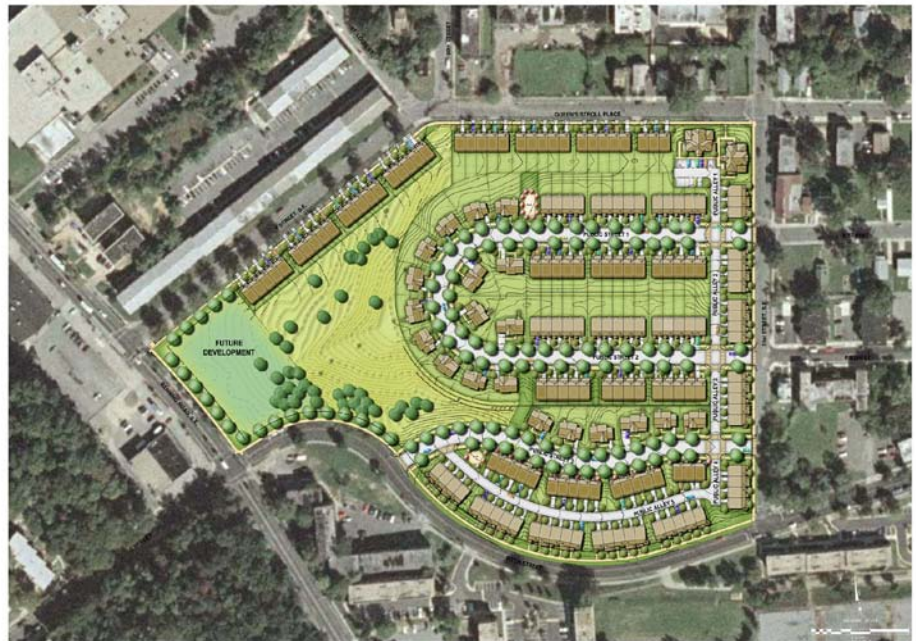
186 UNITS OF CONSTRUCTION A&R / THC II, LLC

This multi-phased redevelopment project incorporated a “New Urbanist” development plan which demonstrated the principals of traditional neighborhood planning and design which included open space, common design standards and performance controls, streetscape enhancements, and updated public improvements.