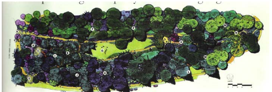
Concept of an Urban Park Located East of Residential Development