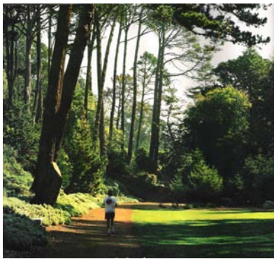
Urban Park and Recreational Trail Concepts