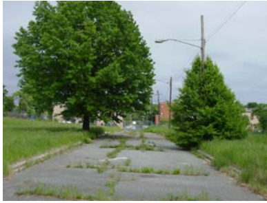
Existing Vacant Property