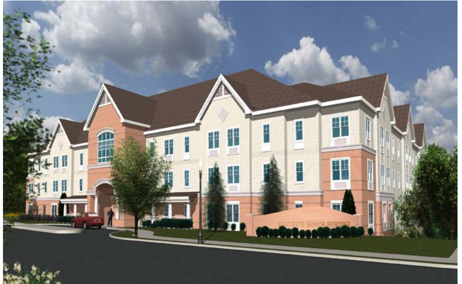
Eastgate Senior Residence Located on a Separate Site Landscaped with a Therapeutic Garden and Pedestrian Amenities for Outdoor Recreation

This project also involved the creation of a Planned-Unit Development requiring various subsequent urban design reviews, public hearings, coordination, and approvals from multiple District of Columbia Municipal agencies; the Zoning Commission; as well as, the National Capital Planning Commission.