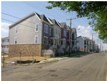
Perimeter Townhouses (Under Construction)